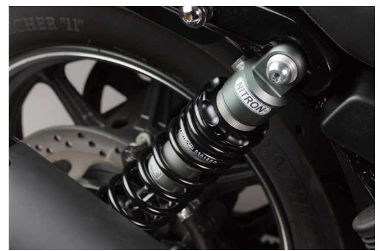
Fitting Image (Harley-Davidson STREET750 /NITRON BLACK TWIN R1 Series)