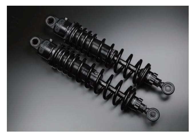
NITRON STEALTH TWIN R1 Series JPY 122,000 TSHD11SS Equips 1way damping adjusters / Internal reservoir tank model Uppershock cover needs to be removed.

For more detail please visit www.nitron.jp Please e-mail to "intsales@nitron.jp@nitron.jp" to request photos for publicity. 4-5-40 2F, Bingo Higashi, Kasukabe, Saitama Japan 344-0032