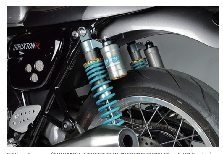
Fitting Image (TRIUMPH STREET CUP/NITRON TWIN Shock R3 Series)

You can make a combination with 3 type of theme color and black or turquoise spring. Find out more details, visit NITRON Website.