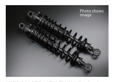
NITRON STEALTH TWIN R1 Series JPY 122,000 TST09SS Equips 1way damping adjuster / Internal reservoir tank model.

For more detail please visit www.nitron.jp Please e-mail to "intsales@nitron.jp@nitron.jp" to request photos for publicity.