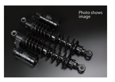
NITRON STEALTH TWIN R3 Series JPY 189,000 TST09RS Equips 3way damping adjusters / Remote reservoir tank model.