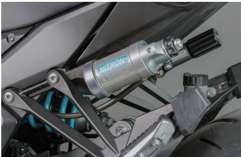
Fitting Image (R3 Series)

R3 Series JPY 181,000 NTBKK60R-TQ Equips 3way damping adjusters / Remote reservoir tank model / Equipping hydraulic preload adjuster / dedicated bracket as standard