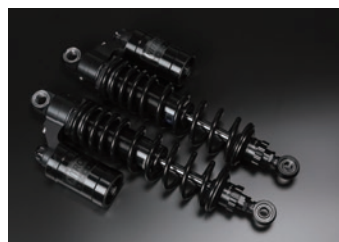
NITRON STEALTH TWIN R3 Series JPY ¥189,000 TST02RS Equips 3way damping adjusters / Remote reservoir tank model