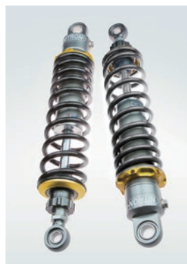
NITRON TWIN Shock R3 Series JPY ¥98,000 TST02SG-BK Equips 1way damping adjusters / Internal reservoir tank model

3 types of color variations are available. Spring color can be selected from either black or turquoise. For more detail please visit Nitron website.