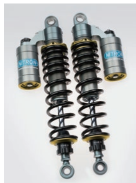
NITRON TWIN Shock R3 Series JPY ¥165,000 TST02RG-BK Equips 3way damping adjusters / Remote reservoir tank model

3 types of color variations are available. Spring color can be selected from either black or turquoise. For more detail please visit Nitron website.